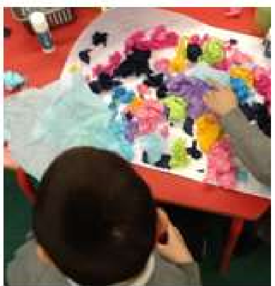
We created a class collage using the story for inspiration!